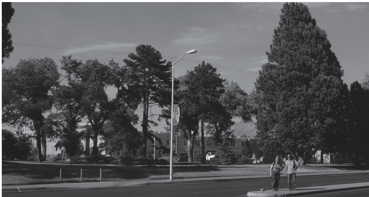
Figure 54: Parsons Grove, 2006